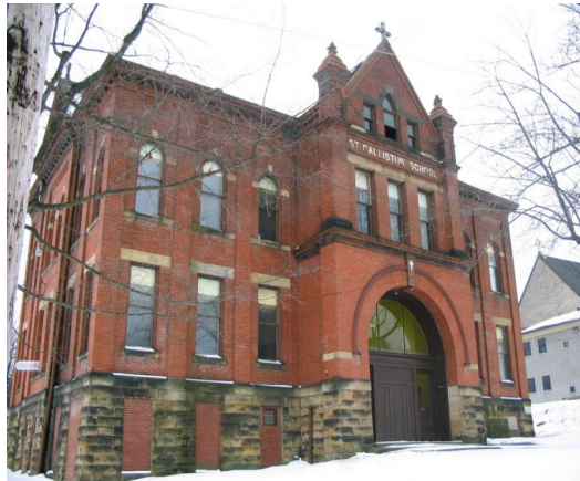
St. Callistus School built 1893, closed as a school 1972.

in 2002 and contains classroom and meeting space. This was accomplished thanks to the successful "Celebrating Yesterday, Creating Tomorrow, Capital Campaign." In many ways the demolition of the old school building is a creating of a new tomorrow. While it is always sad to let go of the past, the space left behind will be used to create green space for use by Religious Education students, parking and a memorial in testimony to those who sacrificed much to establish a school in Kane. A cross from the structure was saved as well as the corner stone. While there are no completed plans at the moment, it is